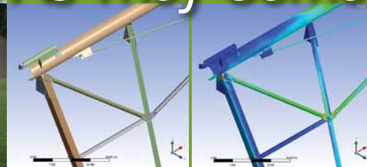
3D Computer analysis of loads and stresses on the Valley drive unit.

Malsam is glad to know the structures hold up so well in the field, but not surprised. "After we design the structures, we do extensive testing here at Valmont to actually try to break them down. We recreate the types of stresses the span faces in the field. In one test we perform accelerated life testing, exposing the structure to loads and stresses over the course of two weeks that would normally occur over 20 years to show us how durable the new design may be. We want the growers to have the most dependable spans possible, and that is what they expect from us."