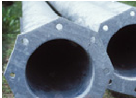
Valley Weathering Steel